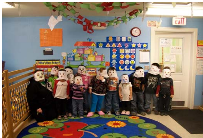
Masking for Russian New Years

The last Federal Review for Chugachmiut head Start was in March 2009. There were several areas of non-compliance, but were reviewed and completed by August 2011. We are awaiting the final report as this is being written. We are expecting our new review to be this school year, by May of 2012, and we are working with staff to be in full compliance at this next review.