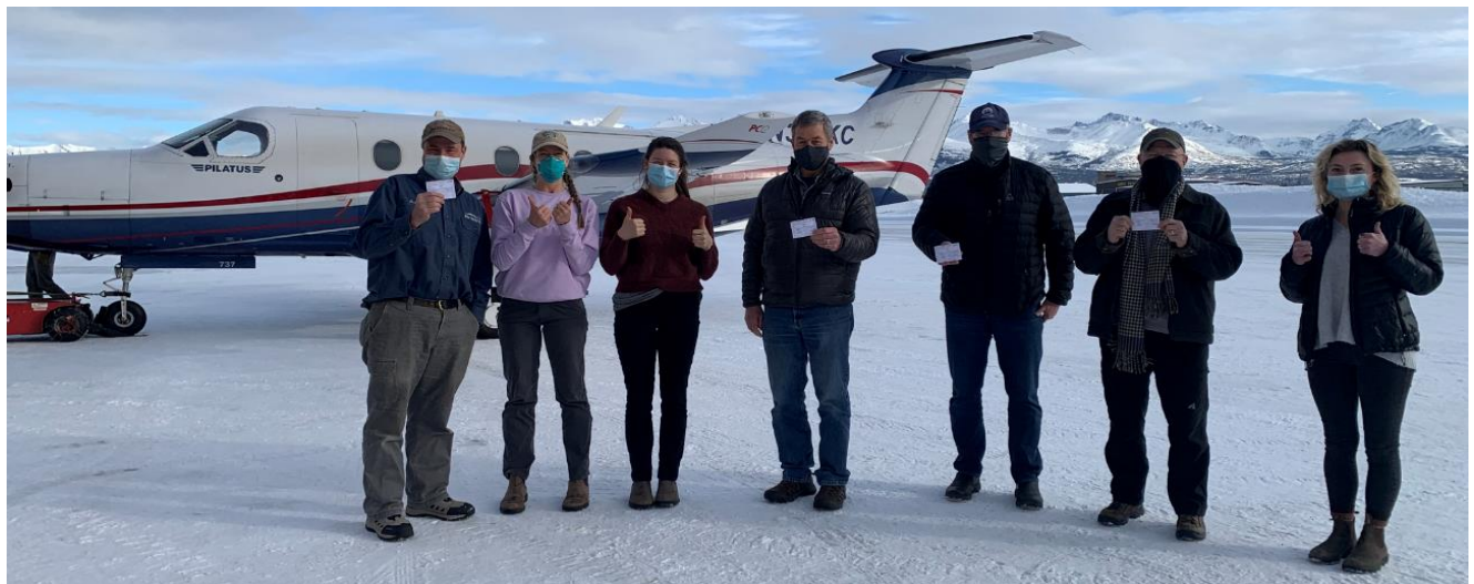
Alaska Air Transit staff COVID-19 vaccinated!